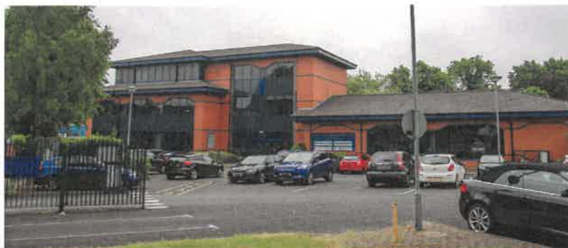
SCIPS Head Office The National Metalforming Centre in West Bromwich

Working in partnership to develop a new Resident Engagement Strategy for Sandwell. This will ensure that Sandwell is compliant with the new emerging legislation.