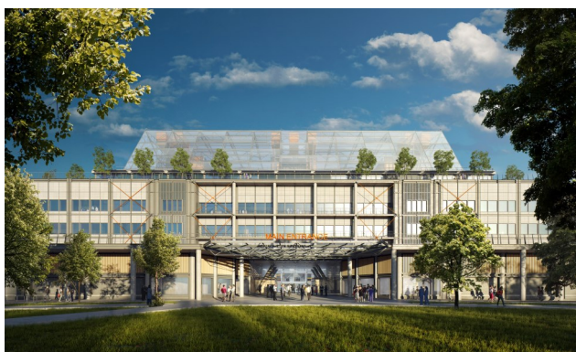
Image of Midland Metropolitan University Hospital

changes that will happen to Sandwell Hospital services.